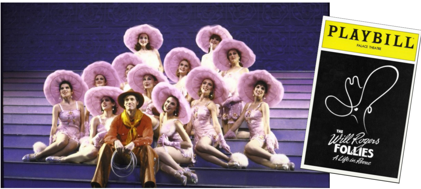
Original Broadway cast of The Will Rogers Follies.