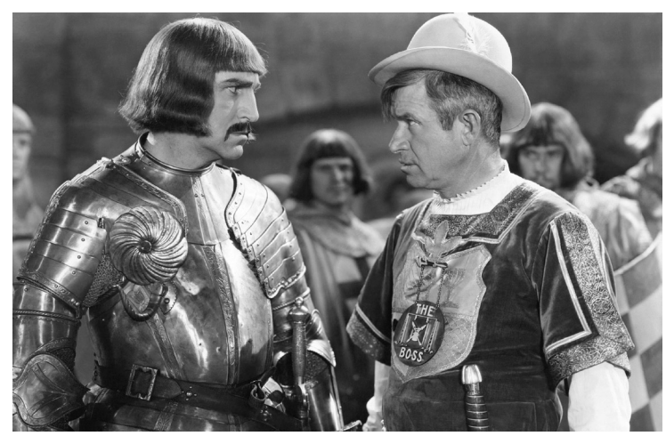
Will Rogers in the 1931 film A Connecticut Yankee

"The movies are the only business where you can go out front and applaud yourself."